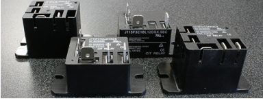
J115F 40amp Series

Relays and switches are becoming highly used in the emerging market of EV Charging Stations. CIT Relay & Switch has a wide variety of relays and switches to suit these products and can customize as needed.