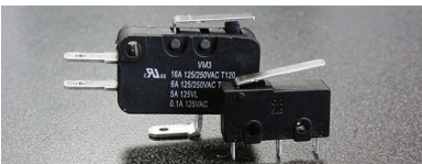
Snap Action Switches

With sealing degree of IP67, CIT Relay & Switch Vandal-Resistant Switches are available in a variety of sizes from 12mm FH & GH Series up to the 40mm DH Series. Also available with UL approval in our AHU and DH22U Series, our IP67 switches offer both ring and dot illumination and non-illuminated options. Choose the EH Series anti-vandal switch for a rounded convex actuator or the AH, BH, CH or DH Series for a flat actuator. Choices of body and actuator color include stainless steel, nickel and anodized aluminum in black, red, yellow, green or blue, with LED bi-color options.