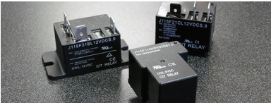
J115F 50amp Series

The J115F Series of relays are available in three styles, all offering heavy contact load up to 40 amp and strong shock and vibration resistance in light-weight and small size packages. PC pin mounting or panel mounting option is dependent upon the style chosen, with contact arrangements ranging from 1A to 1C. Coil voltage ranges from 5VDC to 277VAC with coil power of .60W or .90W or AC coil power of .2VA. Dimensions are depending upon series, with mounting tabs also available. UL and TÜV certified.